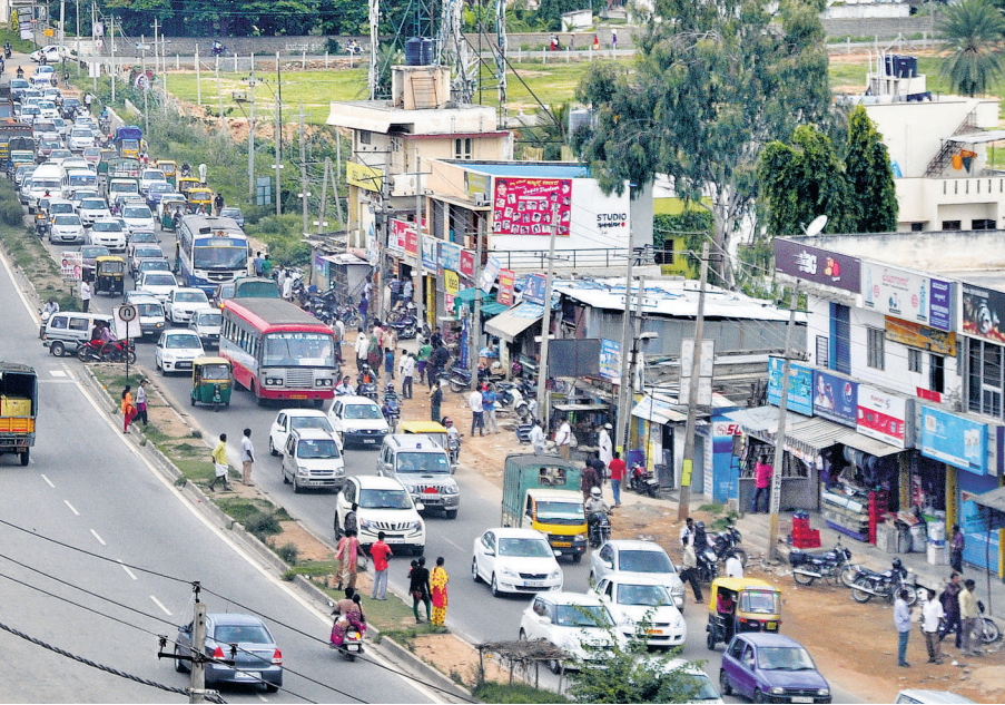
Traffic moves at a snail's pace on Bengaluru-Mysuru Road near Kumbalgod. (Below) A topography survey is on the Mysuru-Bengaluru highway near Maddur.

The acquisition of land would be according to the NH 1956 Act and the compensation